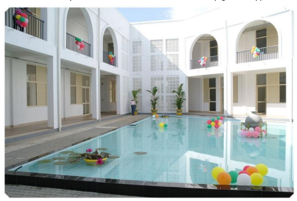
In 2014, the faculty reached another milestone the faculty got the approval for

the new department of Management and Information Technology. At present, the faculty have three departments and one unit namely Department of Management, Department of Accountancy and Finance, Department of Management and Information Technology and Postgraduate Unit.